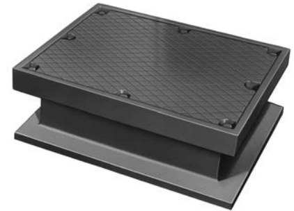
Illustrating Type L

Suitable for low pressure application up to 20 p.s.i. Manhole covers of this series are for use on built-up manholes or slab construction in either regular or seal type design. Suitable for use on pressure manholes or as water-resistant electrical junction boxes on bridges, etc. Lids are bolted to frames with countersunk stainless steel hex head cap screws and sealed with neoprene gaskets. Concealed pickholes are included for complete water-tight application. Units are shipped assembled with gasket glued to frame.